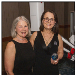
Soroptmist International of Anacortes Service Club Recipient

Island Health Foundation honored these amazing individuals and businesses as our 2025 Philanthropy Award Winners at the Gala.