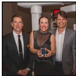
HF Sinclair Business Recipient