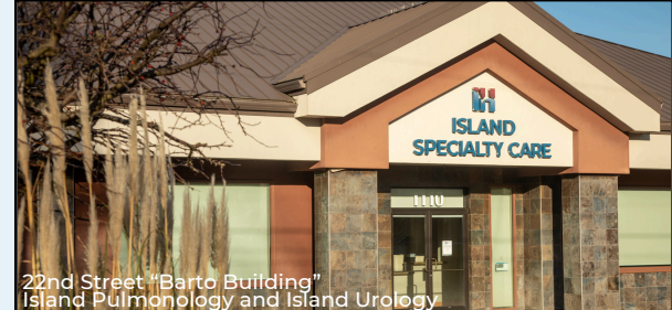
22nd Street "Barto Building" Island Pulmonology and Island Urology

Island Specialty Clinic is projected to open August 2025!