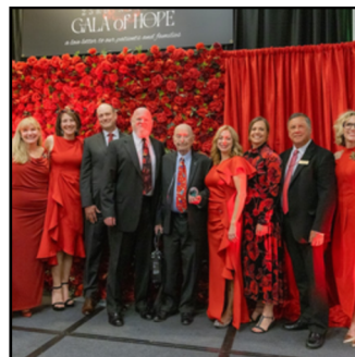
Anacortes Noon Rotary Service Club