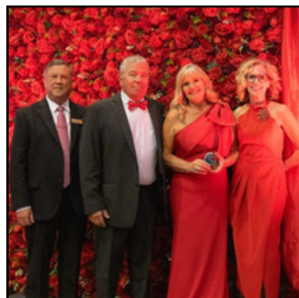
Quantum Constuction Business